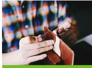
Communication of the Made in Italy