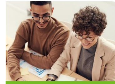
Media and Digital Marketing