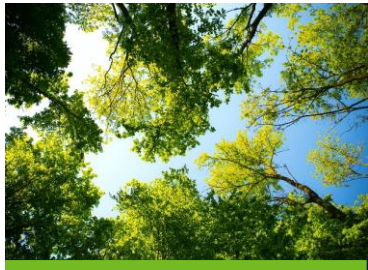
Communication Social Responsibility