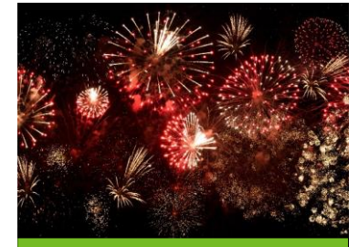
Officina22: Events Location