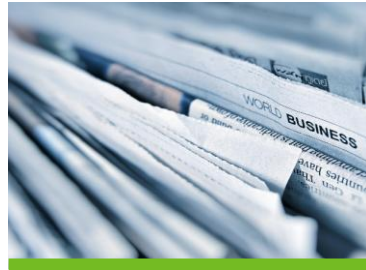
PR and Digital PR