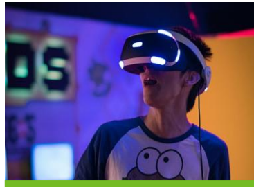
High Tech Communication