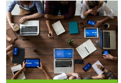
Brand Strategy and Product Communication